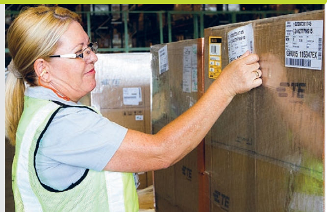
Three more hours afforded for Identification tag correction

To such end, importer/exporter legal representatives should file retagging applications at GRU Airport Client Service Department (CAC) along with the following documents: a copy of the air waybill, the packing list, MAWB and/or HAWD labels, the invoice and an application form specifying the indented correction.