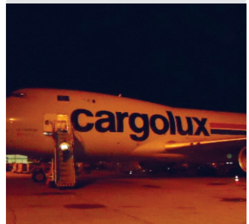
Boeing 747 brought 18-ton helicopter from Luxemburg

Cargolux has regular flights to Brazil and operates at cities such as Campinas, Curitiba, Manaus and Petrolina. The Guarulhos operation is in line with GRU Airport's commercial strategy to expand the offer of cargo flights at Brazil's largest airport.