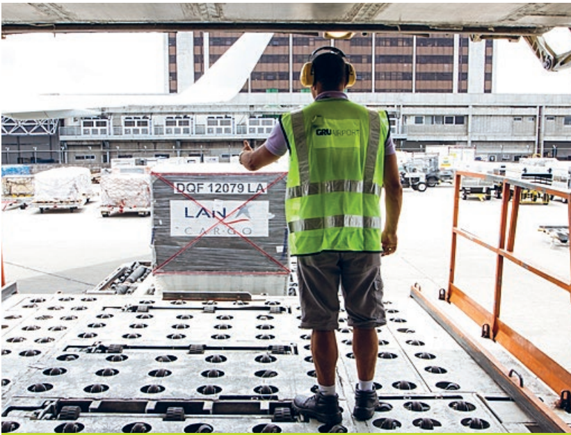
Greater number of cargo operations boost new client interest

Throughout last year, GRU Airport Cargo conquered over 8 thousand new clients. It is a figure that helps consolidate GRU's leadership on the air transport mode, meaning an expansion to 36% of market share.