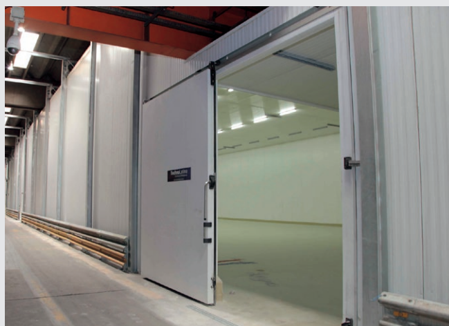
New cold storages: more capacity for perishable

The stacker crane increased from four to ten output points, more than doubling productivity. Moreover, the implementation of e-AWB, in partnership with IATA, provides a more reliable and agile process when information is exchanged between the exporters and the airlines. Another benefit was the construction of a 450m 2 warehouse for hazardous items.