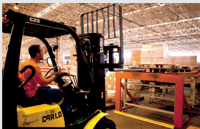
Positive results reflect advances in infrastructure and management processes