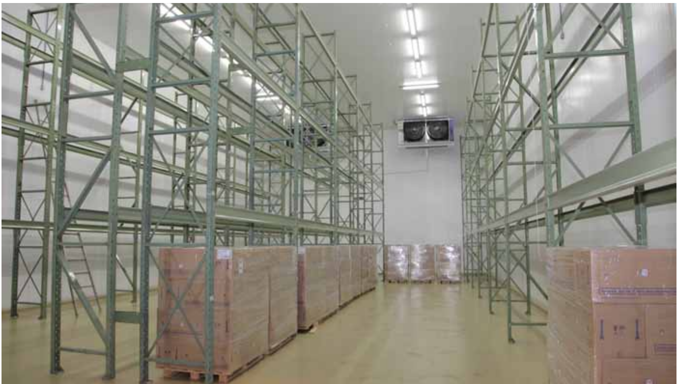
The cold storage capacity at exports is 1.700 m 3 of cargo

The objective of the planned investments for the Cargo Terminal is, most importantly, to improve the service quality and operational efficiency. To this end, actions are divided into three areas: infrastructure modernization, equipment and systems, increased capacity and greater proximity to customers and the logistics chain. ➤