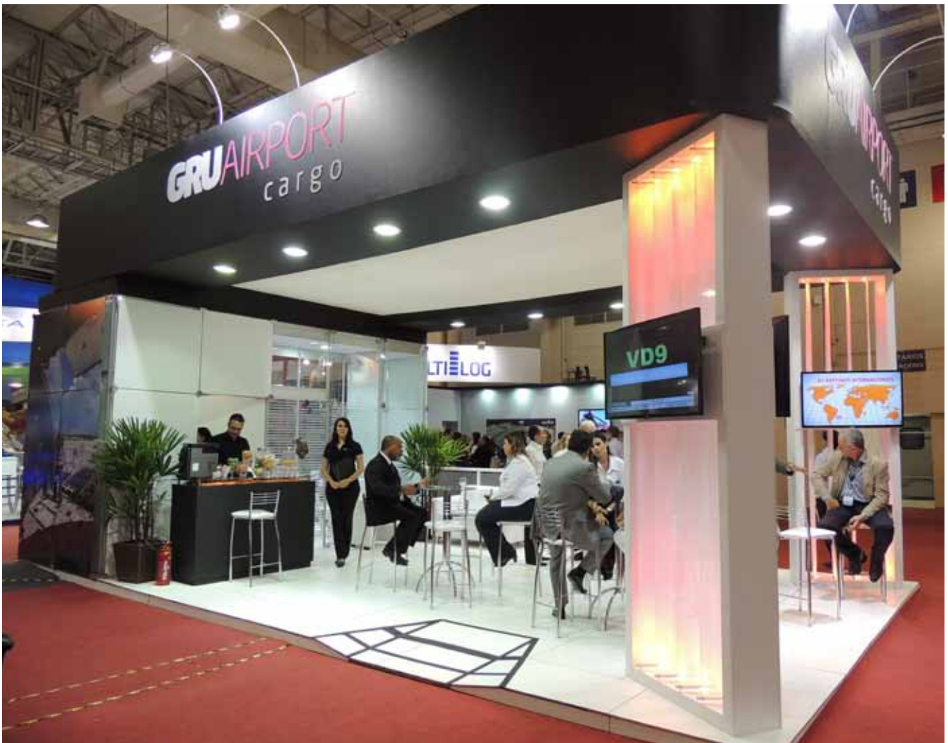
During the event, GRU Cargo highlighted the investments from 2014